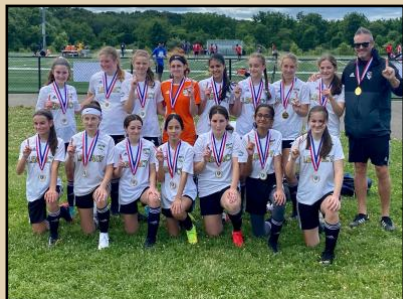
Legacy 08G White