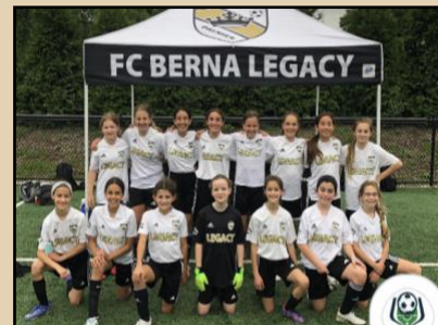
Legacy 2011G White