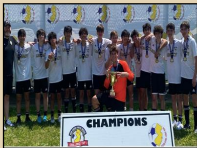
Legacy 06B Black

Champions - 2022 NJYS State Champions Cup